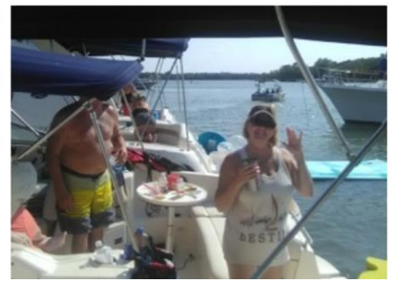
Pre-movie party time!

About 20 boats rafted up and probably another 15 or 20 boats were scattered around to view the movie screen. I estimate well over a hundred people came to our first Movie Night on the Lake! Although during setup that day, we ran into a whole slew of problems, we managed to overcome them all and as they say, "The Show Must Go On".