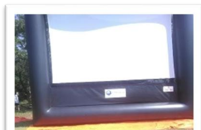
The giant screen was a challenge to put up, but the team prevailed!