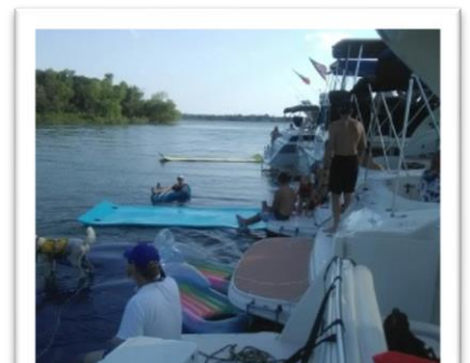
Rafting up with friends for a great night on the water!

The movie was fun ("Overboard" with Kurt Russel and Goldie Hawn) and the weather was wonderful. Go to the Dallas Yacht Club Facebook page or our website, www.DallasYachtClub.org , and check out the pictures that we have posted. Nothing can beat a new moon rising as a backdrop for our movie night on the water—absolutely beautiful!